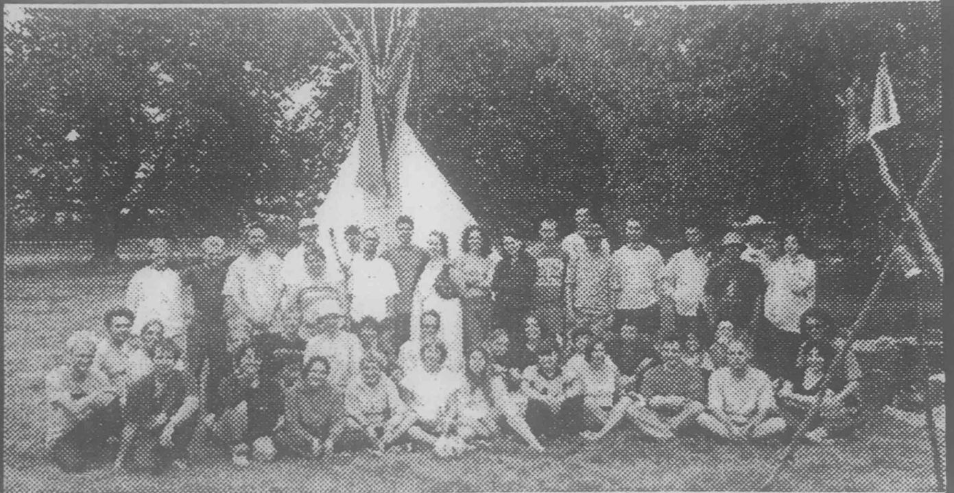
Class of 1998